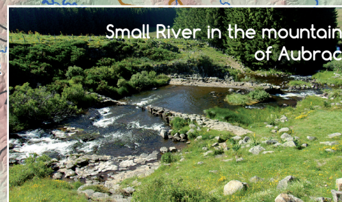
Small River in the mountain of Aubrac