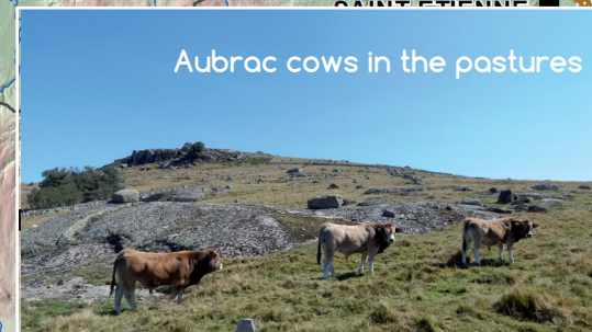
Aubrac cows in the pastures