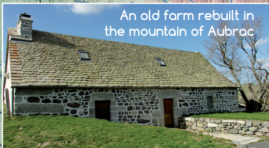
An old farm rebuilt in the mountain of Aubrac