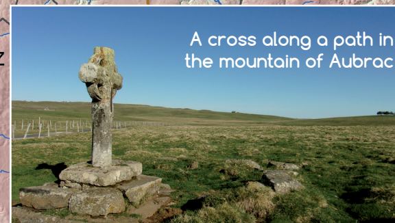
A cross along a path in the mountain of Aubrac