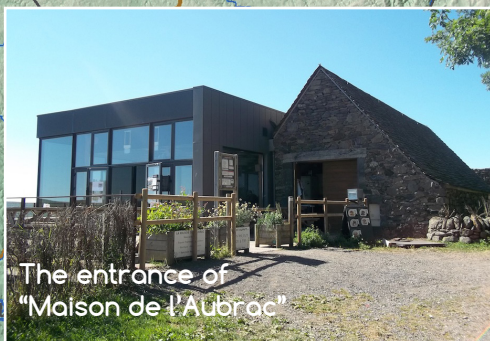
The entrance of "Maison de l'Aubrac"